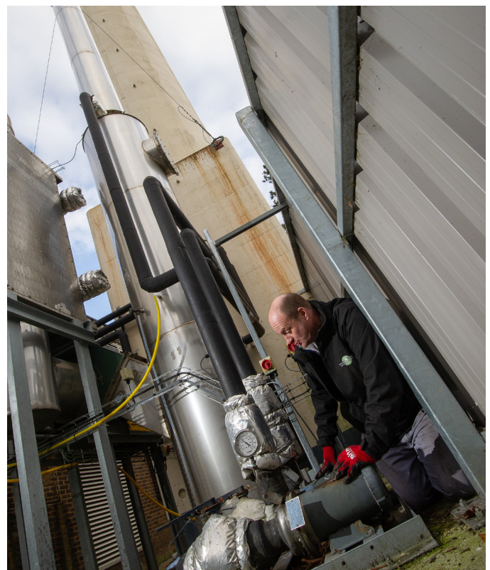
A Thermal Energy Engineer carries out checks on a FLU-ACE® system as part of a servicing agreement.